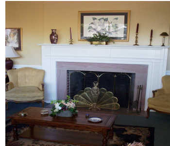
Our Living Room