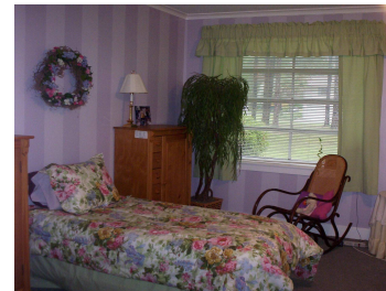
Each of our bedrooms is uniquely decorated.